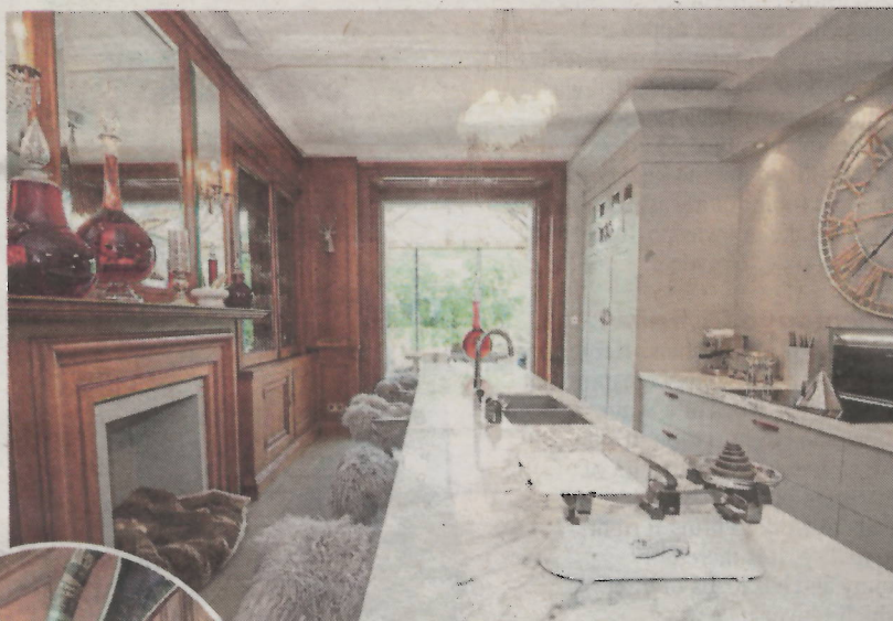
Ground force: The kitchen has fabulous stone flag floors

The hallway Jo so hated was levelled, fitted with a stunning original fireplace - a gift from a 'magpie' neighbour - and laid with traditional encaustic black and white tiles to create a welcoming ambience. Her favourite room, however, is her dramatic and very modern office, streaming with light at the top of the house.