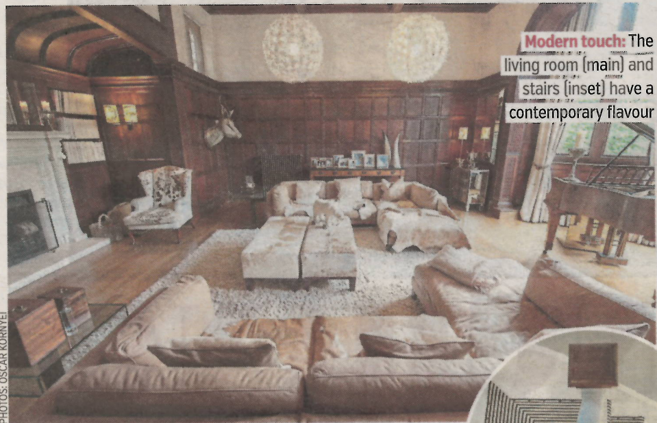
Modern touch: The living room (main) and stairs (inset) have a contemporary flavour

One garden designer has transformed her home into a rural idyll, says Jo Knowsley