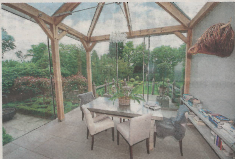
Green zone: The oak and glass conservatory has a beautiful view of the gardens

A lawn unto herself: The gardens were a mess before Jo transformed them